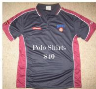
Polo Shirts $40