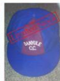
Baggy Hats $75