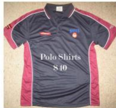
Polo Shirts $40