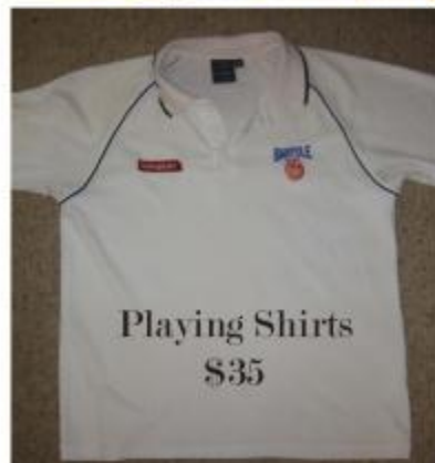
Playing Shirts $35