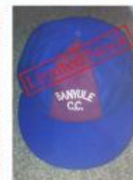
Baggy Hats $75