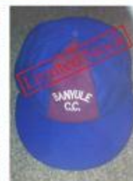
Baggy Hats $75