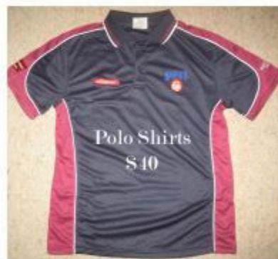
Polo Shirts $40