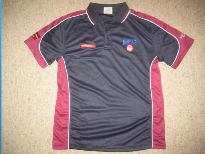
Polo Shirts $40