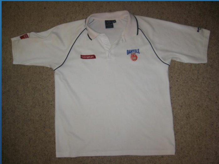
Playing Shirts $35