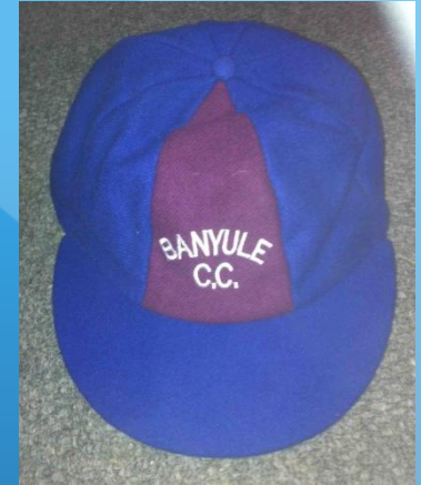
Baggy Hats $75